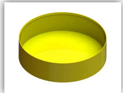
Fig.1 Flexible Pipe Cap