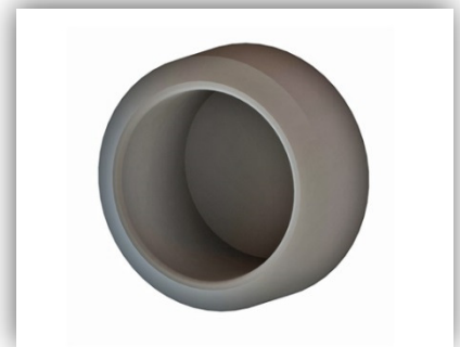
Fig.1 Recessed Cap