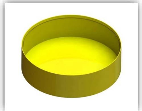
Fig.1 Flexible Pipe Cap