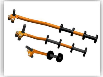
Fig.3 Pipe Roller large, medium, small

Commodity / HS code : Pipe Roller complete: 73269098 : Spare part Rotating Head: 73269098