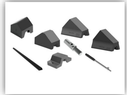
Fig.2 Pipe Stop parts: rails, blocks, connector, end stop, tool