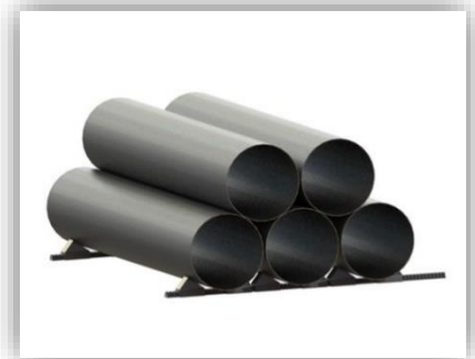
Fig.3 Tubes on Pipe Stop