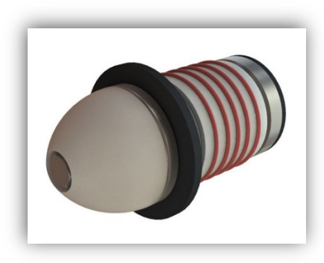
Fig.2 Coupling Mini Adjustable