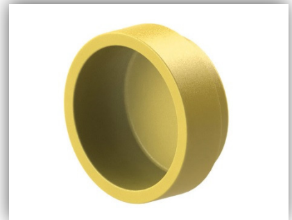
Fig.1 Flexible Recessed Cap