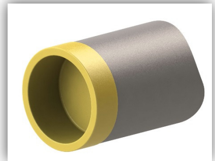
Fig.2 Pipe with Flexible Recessed Cap